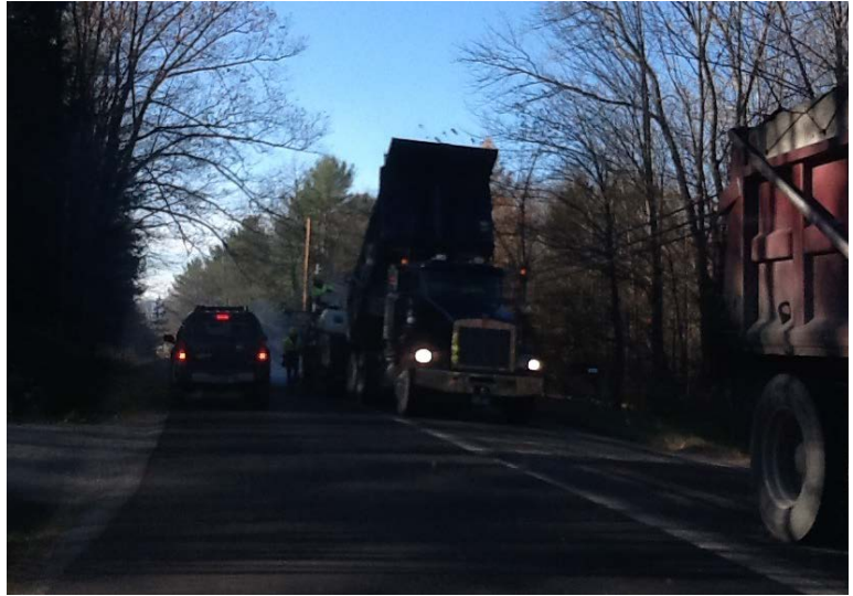
Richmond Road Paving - 11/4/2013