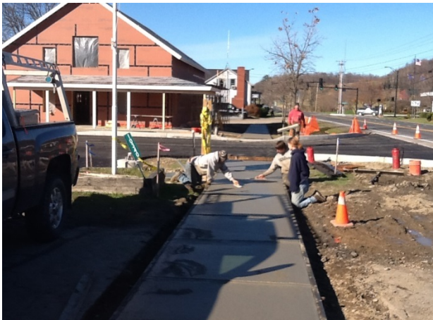
Placing New Sidewalks - 11/4/2013