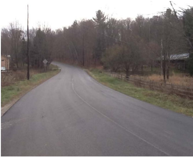
Richmond Road After Paving - 11/6/2013