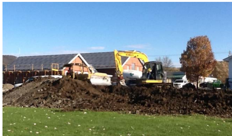
Smoothing, shaping, and seeding of dirt Pile behind Fire Station. This is the fill necessary for future fire station additions. - 11/5/2013