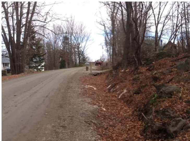
Ditching & Prep Work for Magee Hill Culvert Upgrade Project - 11/6/2013