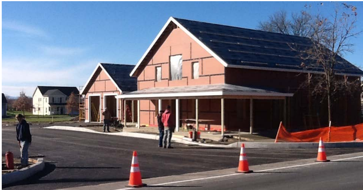
View off of VT Route 116 - 11/4/2013